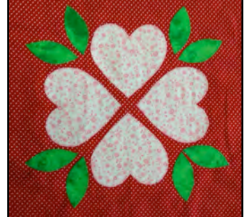
ABOVE LEFT: February's Disappearing 9-Patch BOM ABOVE RIGHT: February's Applique BOM