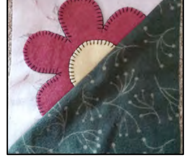
ABOVE LEFT: January's Disappearing 4-Patch BOM ABOVE RIGHT: January's Applique BOM