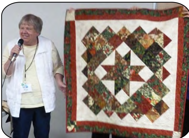
Oregon Coastal Quilters Guild