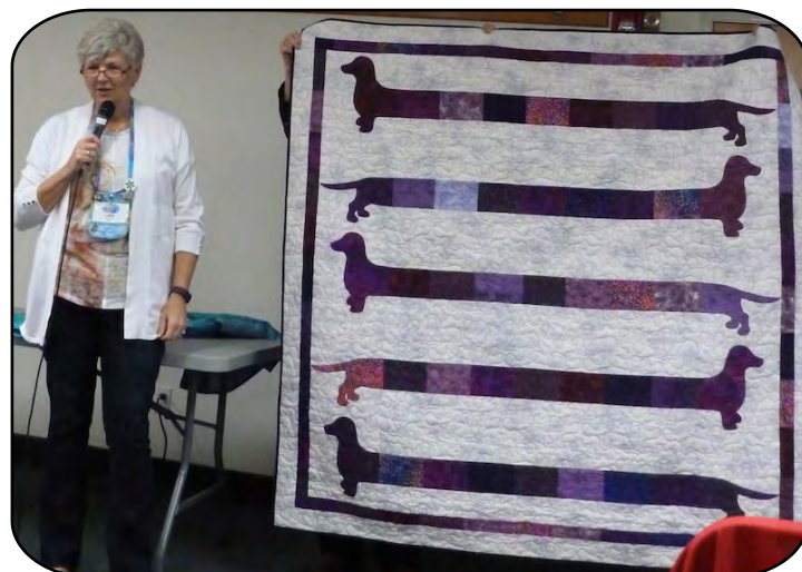
ABOVE: "Long Dogs," front view.