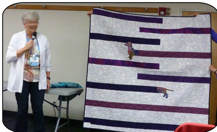
BELOW: "Long Dogs," back view.