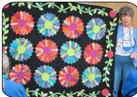
Two (of five) quilts shared by Paulette Stenberg included "Blue Stars" to be raffled by the Fishes of Lebanon charity and "Midnight Dinner" (Dresden plates) made from what she collected on a coastal shop hop.