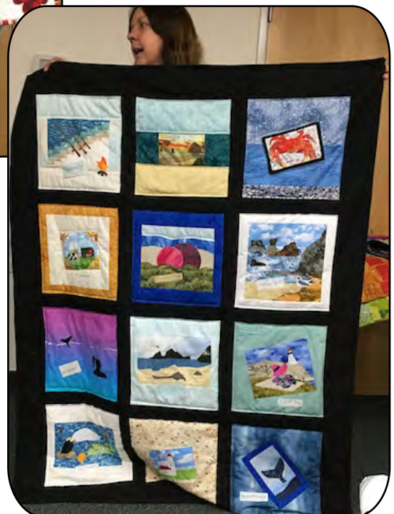
(BELOW) Lorna Myers completed her Quilt Run 2016 project with blocks from shops from Astoria to Brookings.

See more Show and Share photos in the FQN Online Extra Edition.