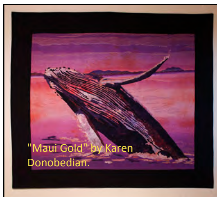
"Maui Gold" by Karen Donobedian.

The March 10-12, 2017 show will be held in Yachats at The Commons multi-purpose room from 10 am-5 pm each day. A $5 donation will help defray show costs.