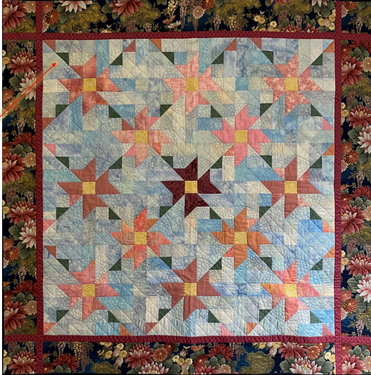
Breath of Spring

Base is a 6" block and sashing forms the flowers – a great stash-buster using 2 ½ " strips. The pattern came from Community Quilters.